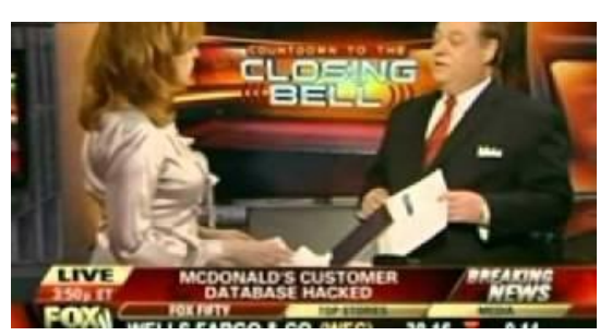
Fox Business "Closing Bell"