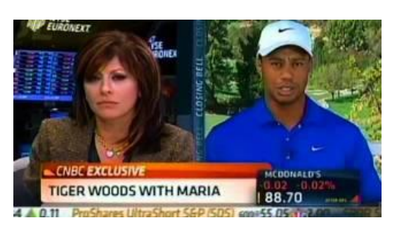
CNBC "Closing Bell"