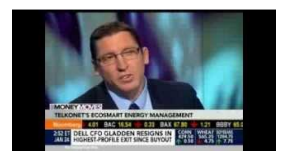
Bloomberg Television "Money Moves"