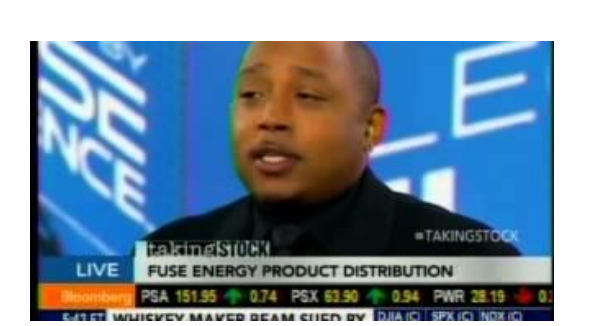
Bloomberg Television "Taking Stock"