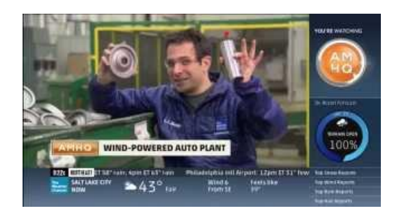
The Weather Channel

We have secured prime-time, live Business Television interviews for our clients, providing them with a national platform on which to tell their story to millions of investors.