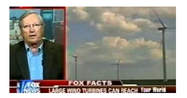
Fox News "Your World with Neil Cavuto"